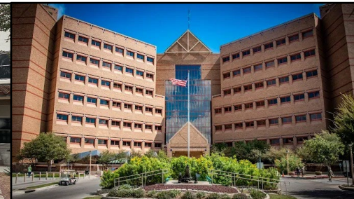
Brooke Army Medical Center 3551 Roger Brooke Dr (B.A.M.C) Office # 210-916-1105

JBSA: #1 Place to Work, Train, & Live – at Leading Edge of Innovative & Joint Solutions