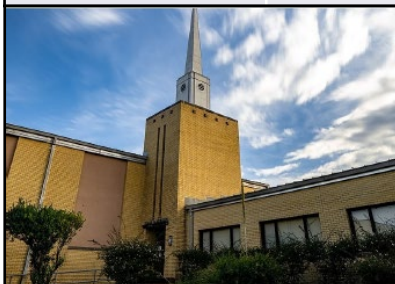
AMEDD Chapel 3545 Garden Ave BLDG 1398