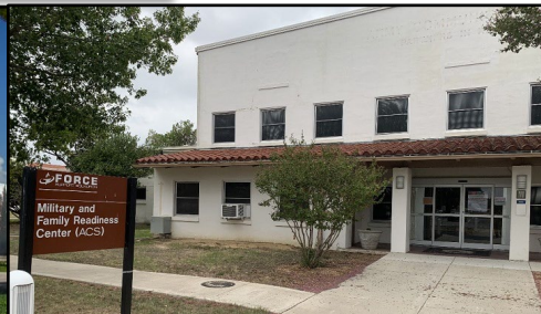
Military & Family Readiness Center 2797 Stanley Rd (M.F.R.C) BLDG 2797