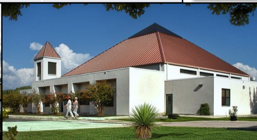
Dodd Field Chapel 3600 Dodd Blvd BLDG 1721