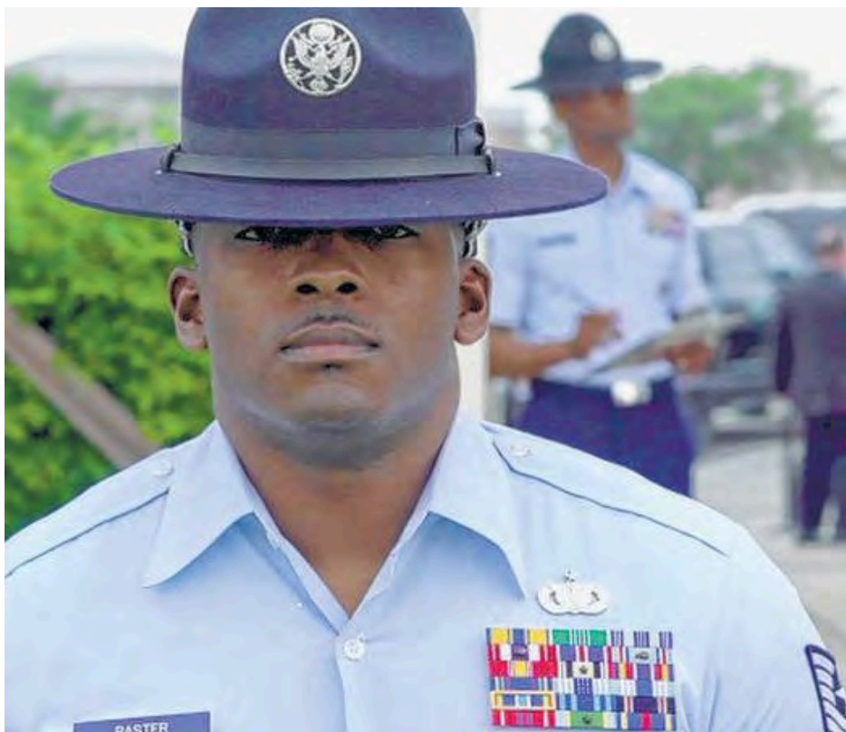
A major change in body and mind is coming to the way Basic Military Training transitions civilians into Mach-21 Airmen.